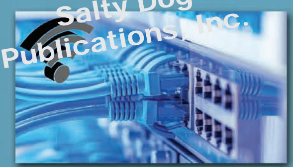
Wired and Wireless Network Solutions

Rethink the way you put technology to property our home or your business. Dog