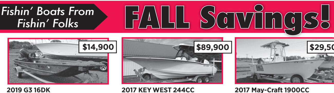
Yamaha 50HP Tiller Bear Trailer