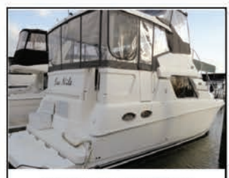
39' Silverton 392 MY '99 Roomy interior, nice condition! $89,900