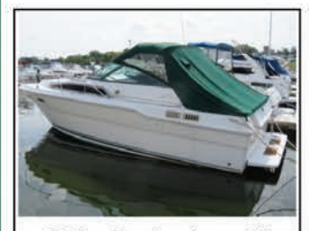
30' Sea Ray Sundancer '89 Generator, new engines '14 $23,500