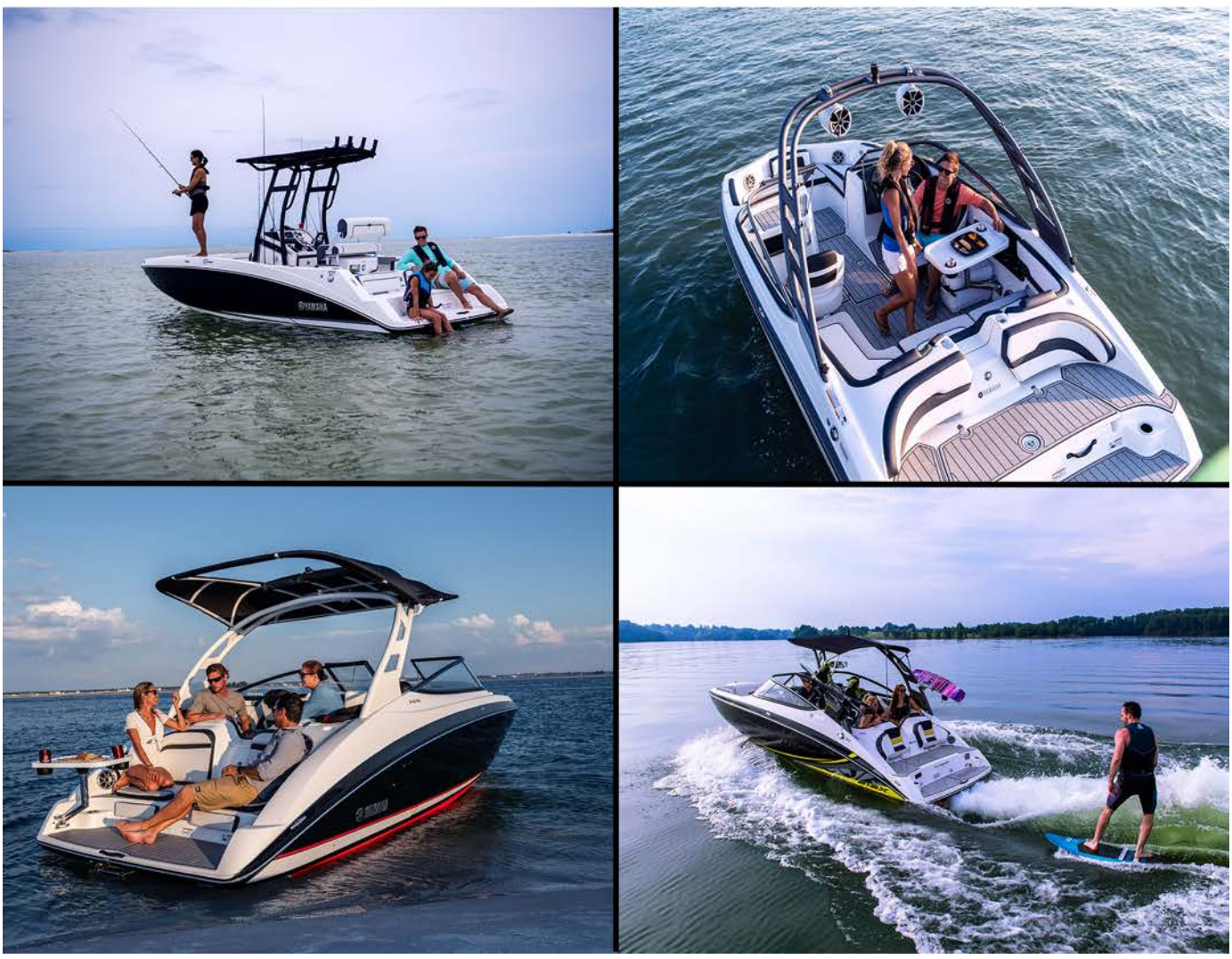
DOWNLOAD THIS ISSUE OF THE SALTY DOG AT WWW.THESALTYDOG.COM