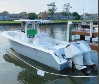
30' 2020 Sea Hunt 30 Gamefish $189,000

Interested in Selling.... Give Us A Call Today! 443.877.7080