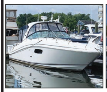
37' 2010 Sea Ray 370 Sundancer $170,000