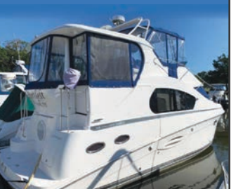
35' 2004 Silverton Motor Yacht $139,900