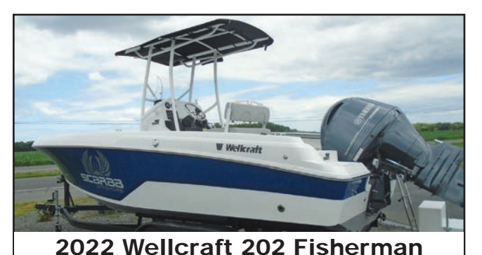
Stock #WEL03W Yamaha 150hp 4-stroke, trailer MSRP $78,074 • Call for Price