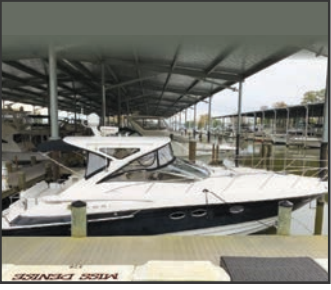
44' 2009 Regal 4460 $275,000