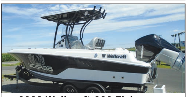
2023 Wellcraft 222 Fisherman Stock #WEL03X Mercury 250hp Verado, trailer MSRP $124,163 • Call for Price

All prices includes prop(s), battery(s), 1/2 tank of gas, local delivery, in-water demo, basic safety package and 3 years of winter storage at no charge.