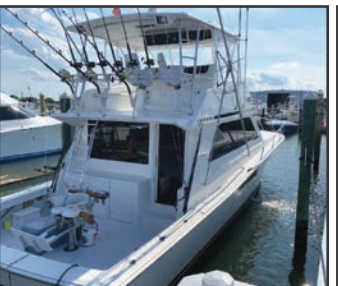
50' 1998 Viking Convertible $280,000