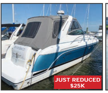
34' 2005 Formula 34 PC $114,500