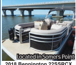
2018 Bennington 22SSRCX VF 150 Yamaha, 115 hours, $49,300