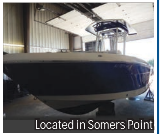
2021 Robalo R242 Explorer Yamaha F300UCA, 45 hrs, $105,000