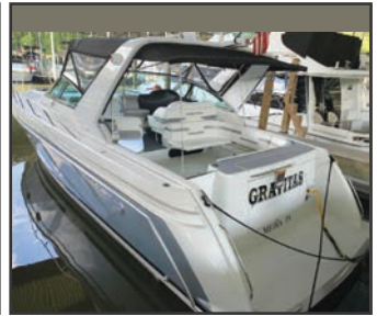
41' 2004 Formula 41PC $205,000