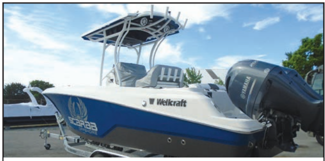
2023 Wellcraft 242 Fisherman Stock #WEL02X Twin Yamaha 200hp 4-strokes MSRP $135.258 • Call for Price