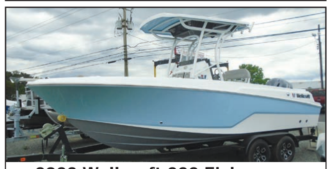
2023 Wellcraft 222 Fisherman Stock #WEL01X Yamaha 200hp 4-stroke, trailer MSRP $101,980 • Call for Price